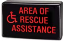
HDI-ARA-F1 & F1B*