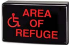
HDI-ARA-F4 & F4B*