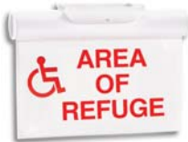
HDI-ARA-C4 & C4B*