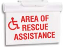
HDI-ARA-C1 & C1B*